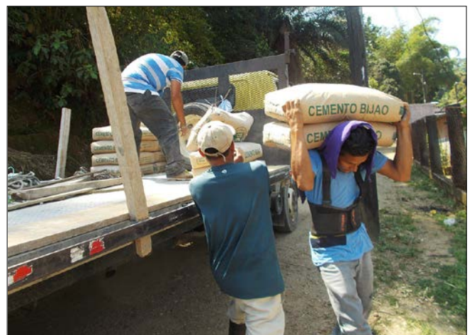
Materials for a new roof and outbuildings for San Martín and school repair in Santo Domingo.