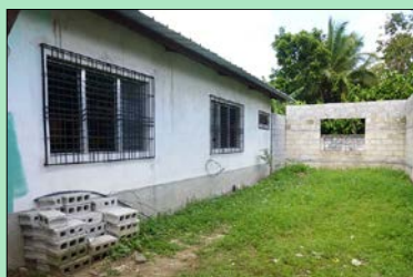
Consulting room in progress