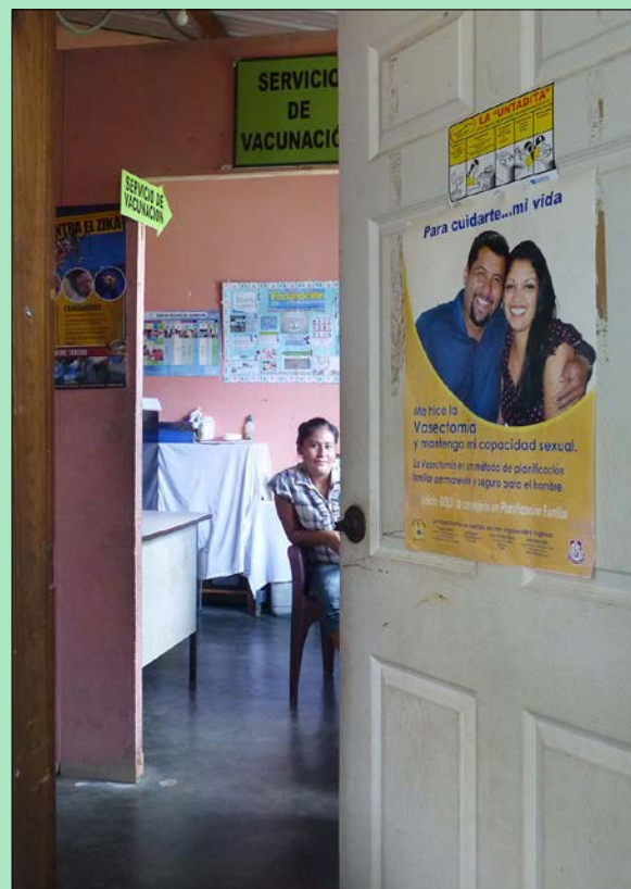
The vaccination room, with an informative poster about vasectomies.

These dedicated nurses are pleased to receive the donated medical supplies! FECOVESO also supplied materials to add a room in Tegucigalpita and a new consulting room in El Paraiso. These clinics are on the coast, but serve many who come down from the mountain communities.