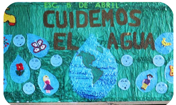
Sign made by school children to tell everyone: "We take care of the water!"

This is an all day event celebrating the completion of a water system that serves four communities. They have included a focus on education, appreciation and protection. Work has been supported in construction, expansion or repair of 35 water systems since 2001.