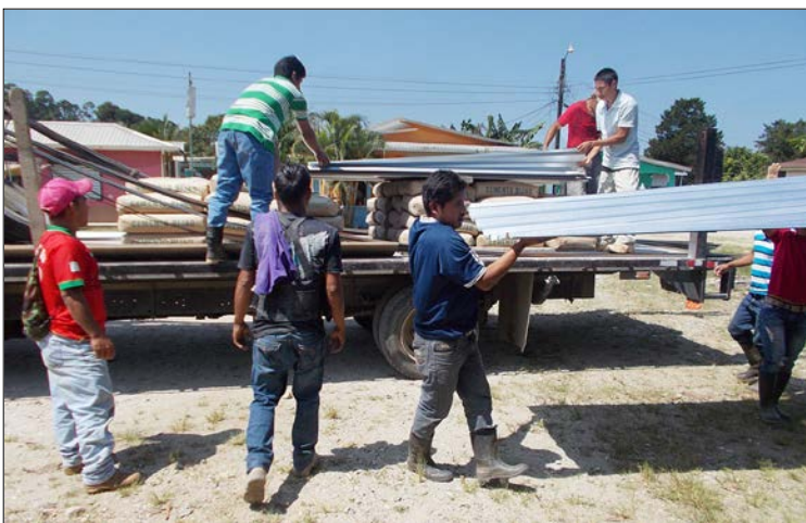
Unloading materials for a water system for San Miguelito, Quimistán, and materials to repair school latrines and replace the roof in La Providencia.